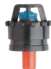
Conic male inlet